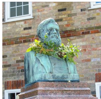
Potto Brown Memorial at Houghton