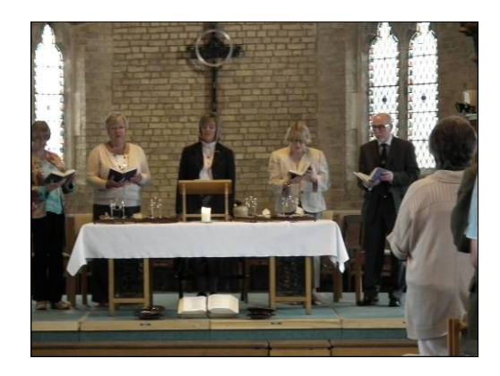
Chapel Prayers are held daily at 10am, when we pray for those in need in our community and beyond.

Special services are held on major festivals.