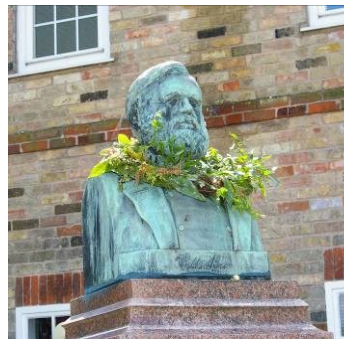
Potto Brown Memorial at Houghton