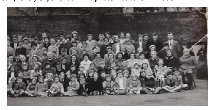
Anyone recognise anyone else?