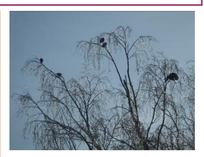
Frost hanging like jewels from Babs