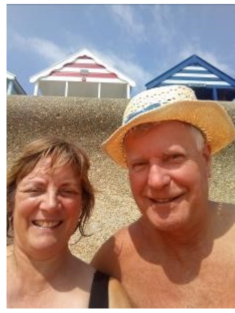
They send their love to everyone.....