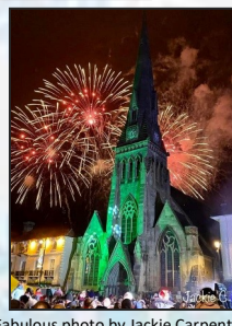
Fabulous photo by Jackie Carpenter

Read online at: www.stivesfreechurch.org or visit our Facebook page