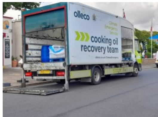
Recycling cooking oil from Kiosks.....