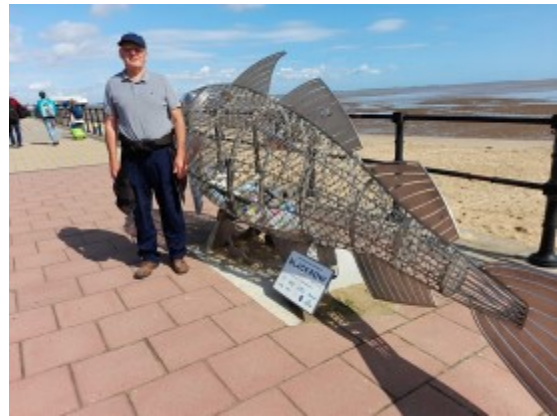
Fish sculpture for dry recyclables—Cleethorpes

Thatched 'double church' at Pakefield, near Lowestoft. Two churches, All Saints and St Margarets, side by side with two naves, two chancels and two altars but only one tower. The first church was on this site around 600-700 AD when Christianity became well established in East Anglia. The church was mentioned in the Domesday Book of 1085. Much has changed over the years of course and, in 1941, incendiary bombs set fire to the thatched roof. After many setbacks over the centuries, and risk of close proximity to the sea, the congregations and residents just knuckle down and rebuild.